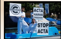
By: La Quadrature du Net

July, 15th, 2010 Brazil's Discussion On Copyright Law Reform – Response To The Digital Era?