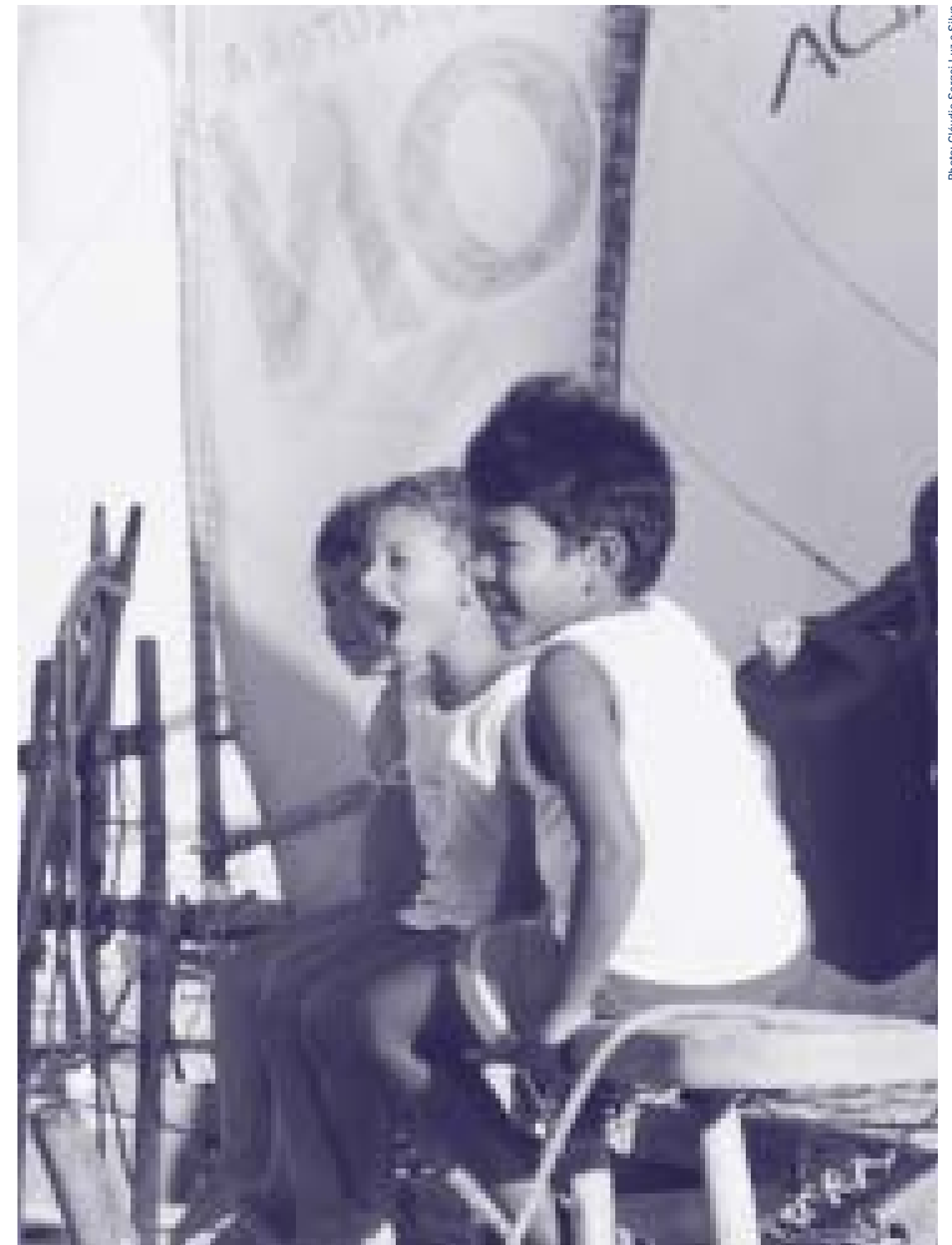
Brazil: Children playing on a fishing boat on the north-eastern coast of Brazil.

Overall objective(s): To produce a final report and an analysis of the EI transition period.