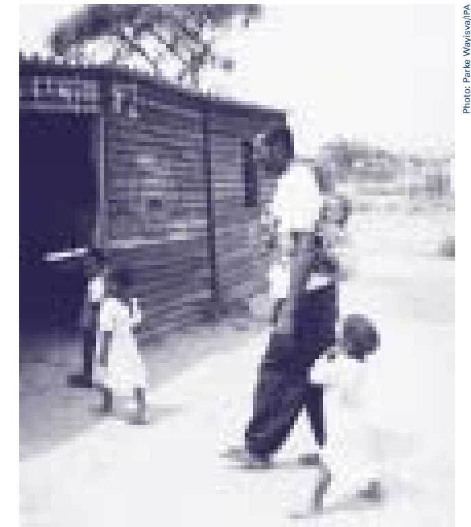
Zimbabwe: A father takes his child to the ECD play-site. Child Welfare Programme; Inter-Country People's Aid (IPA)

Partner organisation(s): Farm Community Trust of Zimbabwe