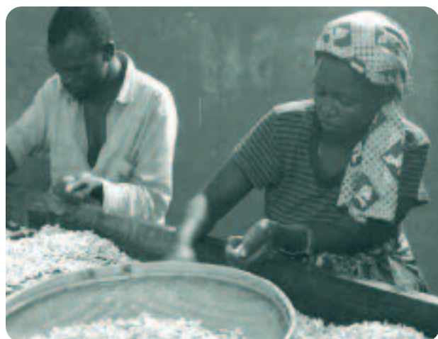
Employees at a cashew processing unit in Nampula province

The other direct partner is the Mozambican Association for Rural Development (AMODER), a microfinance institution based in the capital Maputo, that identifies, promotes and finances local project initiatives, and raises funds both within and outside the country. In the CASCA programme, AMODER offers low-interest loans to the processing units, and manages the funds received from Hivos, the programme donor. SNV also works with three other 'indirect' partners. A medium-size factory in Namige buys the semi-processed kernels from the processing units, and grades and packages them for export. TechnoServe, an American NGO, provides technical assistance and advice on equipment, product quality standards, etc. Finally, the National Cashew Institute (INCAJU), the parastatal for the sector, provides a link between the programme and government agencies, and is playing a vital role in helping to create a more favourable institutional context for agro-business ventures such as CASCA.