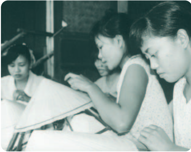
Women in Quang Binh province making hats

nine months. They also undertake to guarantee each others' loans. No one can receive a loan or training if any member of the group is in arrears. Thus peer pressure ensures that most women repay their loans within the agreed period. So far, the proportion of women in arrears has been low – between 2% and 5% – and write-offs currently stand at just 0.1%.