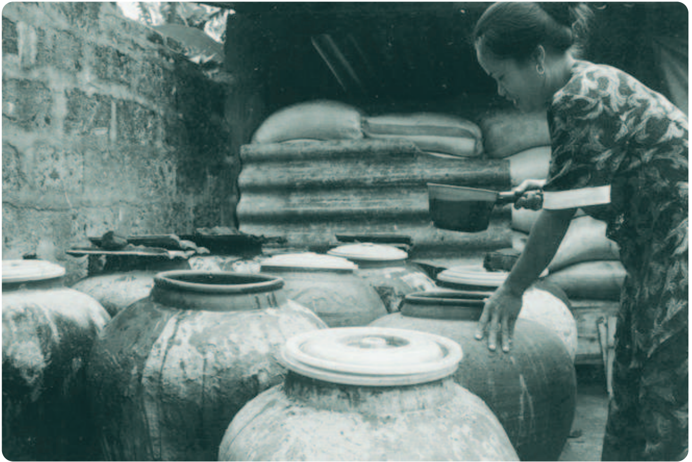
Women in Quang Binh province making fish sauce

To deal with this problem, some 200 women have linked up with a local SNV biogas programme, which processes the waste in a simple fermenting unit and produces biogas that can be used for cooking. This saves the women both time and money, and helps to improve their living conditions. Other women are producing goods such as baskets and hats, and fresh and processed foods such as mushrooms, fish sauce and gherkins, some of which are now being exported to Europe and the United States.