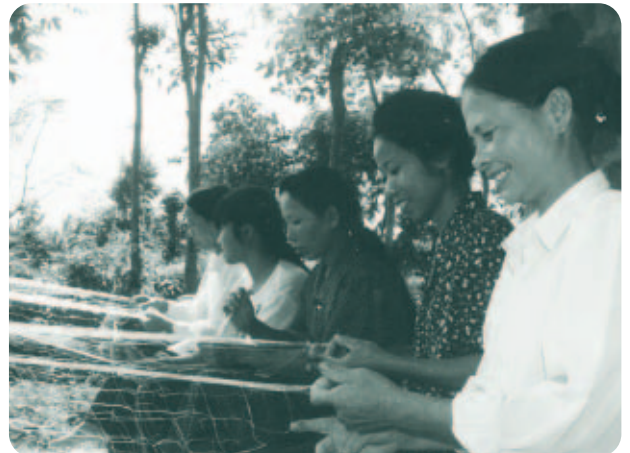
Women in Quang Binh province making fishing nets

By mid-2005, a total of 11,500 women in Quang Binh province had joined the NAPA programme, of whom about 8,500 are still active. All of these women have saved, attended training courses, and have taken out loans to set up their own micro-enterprises or income-generating activities. About 1,000 women have been so successful that they are now eligible to receive larger bank loans. It is expected that this number will increase steadily in the future.