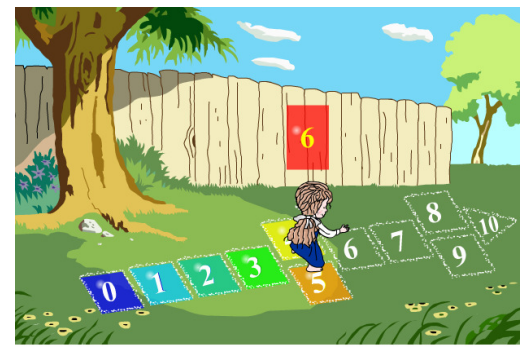
A screenshot taken from a mathematics game developed by teachers working with AYNI

through the projects and got to know places which we will never be able to visit.'