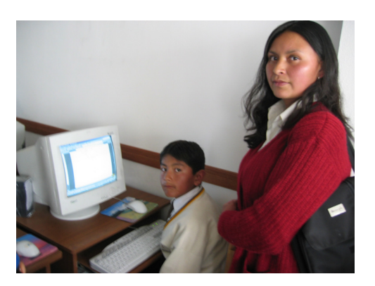
Teachers give a presentation of local content to parents and students

Teachers and students also reported experiencing a greater level of awareness about the benefits of ICTs as well as a sense of empowerment after using ICT in the classroom. They are aware that ICT is a necessary tool to secure access to the educational resources needed for teaching and research in the classroom. One teacher expressed how they 'got to know how to use the technology in [their] daily teaching life, and see the students using the computers with incredible satisfaction'.