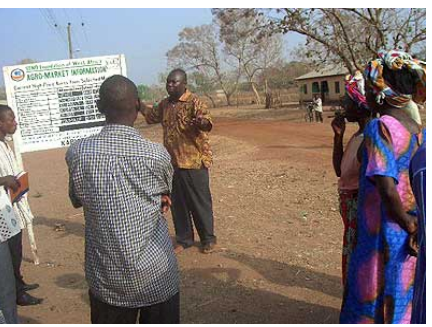
Notice board in one of the participating communities

• Low income of potential buyers Reliable access to market information will enable small farmers to negotiate for favourable prices and therefore to increase their income.