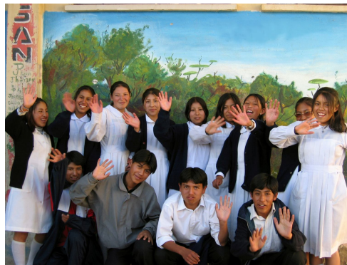
Teachers and students of 1,000 primary and secondary schools are the main focus of the programme.

The programme is directly advised by IICD and its partners in Bolivia. Since 2003, IICD together with Global E-schools and Communities Initiative and the Spanish