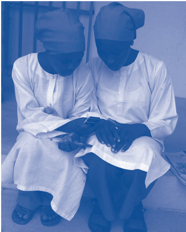
Girls in Bauchi, Nigeria using a cell phone

Culture has many facets and is ever evolving. You and I are responsible for our own culture and with this comes the responsibility to constantly question if and how certain aspects of our culture are good or harmful. It is from such an understanding that we can come up with successful projects that will work towards empowering men and women and ensure that communities keep HIV infection at bay. ■