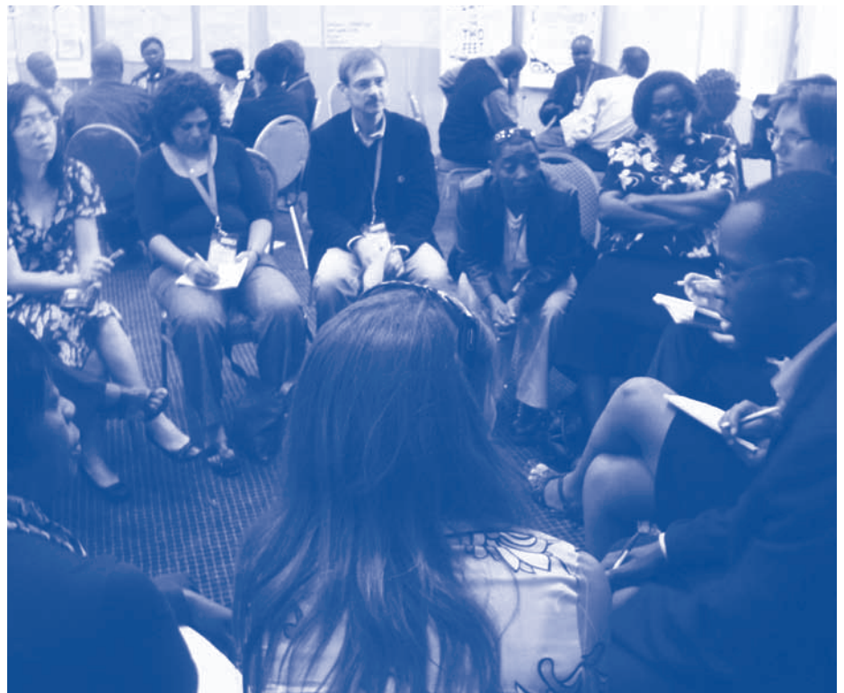
A group session during the conference

Access to quality health and education services is hinged on better resource allocation. Monitoring programmes that enable communities to understand and demand transparency and accountability in government budgets have been successful. Many civil society organisations find it difficult to obtain regular funding for