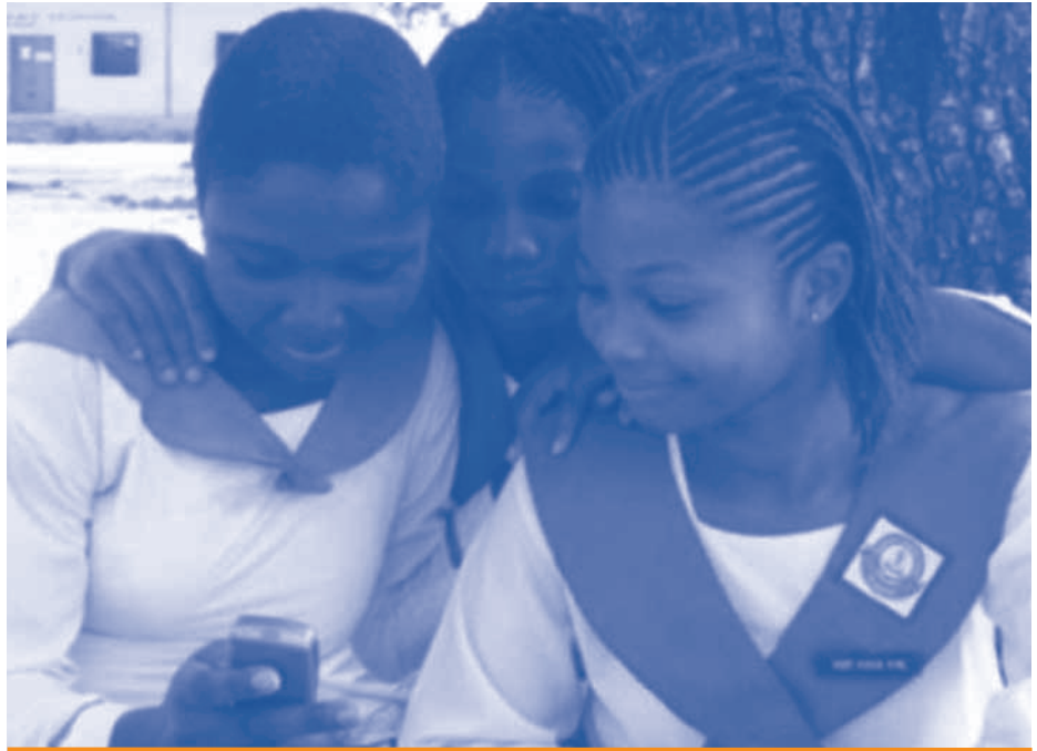
Nigerian students using the mobile service

Equally important was the need to work with religious, community and government leaders