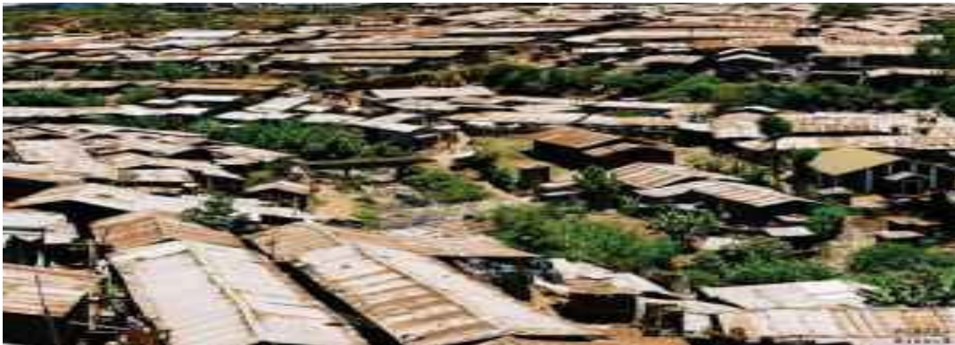
Kibera Slum in Nairobi: One of Africa's largest slums.

On the other hand, Nairobi has a high influx of rural-urban migrants who come in search of employment. This rapid urbanization, with inadequate housing has resulted in the mushrooming of informal settlements called slums. These slums are in a state of apathy with poor sanitation and environmental conditions. They generally lack basic amenities such as toilets and piped water. The inhabitants have poor access to health services and are therefore susceptible to various health problems.