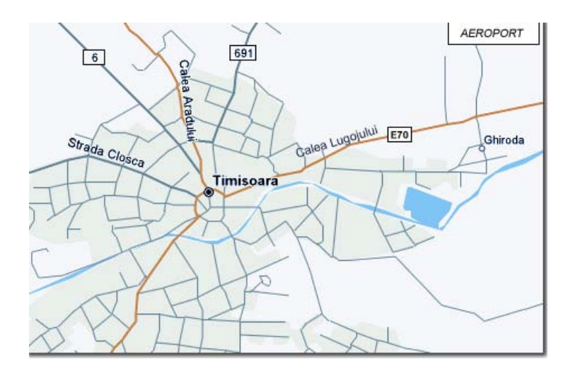
Map of Timisoara city and principal roads

There exists one airport close to Gârla Mare. It is in Timisoara and is named the International Airport of Timisoara (Trian Vuia). The Timisoara International Airport is located 12 km east from Timisoara centre. It is also the main air gate of entrance to the Western part of Romania, being located in the North East part of Timisoara. Tourists can also have access to the airport by the main European road E70<sup>35</sup>.