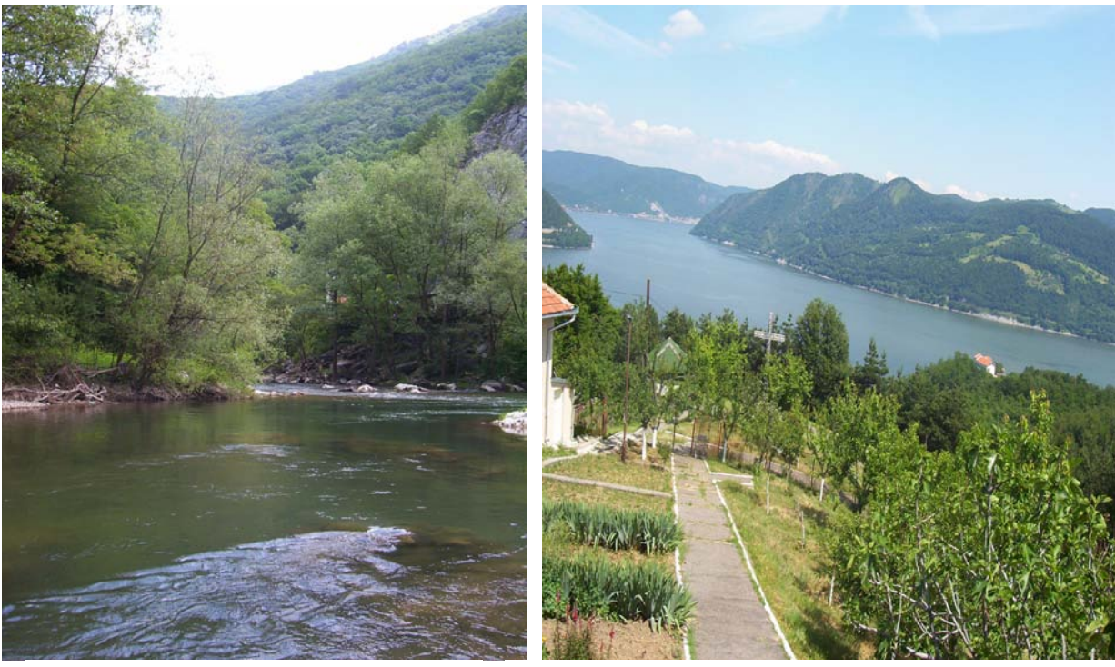
Surroundings of Bâile Herculane

Orsova can be very attractive to tourists with a special interest in nature. It has a famous monastery on top of a hill, which provides a splendid view on the surrounding nature. It also has beaches alongside the river, which provide some possibilities to enjoy water sports. Canoeing and making tours with small boats along the Danube River are two of these possibilities.