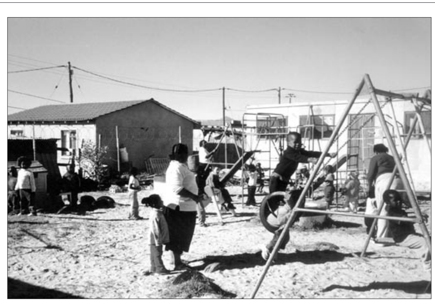
Crèche for HIV/AIDS affected children, Lizo Nobanda Institute, Khayelitsha