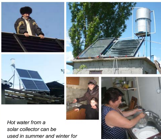
Hot water from a solar collector can be used in summer and winter for different purposes.

Imagine washing your dishes with hot water and taking a hot shower regularly at no cost other than installation! The solar collectors are designed to resist freezing, allowing year-round use even during cold winters. They are easy to construct and to maintain.