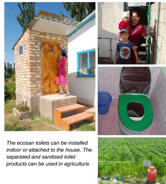
The ecosan toilets can be installed indoor or attached to the house. The separated and sanitised toilet products can be used in agriculture.

The toilet products – urine and faecal compost – can be used as organic fertiliser. Urine is an excellent liquid fertiliser containing nitrogen, phosphorus, potassium and many micro-nutrients. The fertilised plant will grow faster, develop more leaves and produce higher yields. Faecal compost is an excellent soil conditioner and fertiliser. The safe application of urine and faecal compost requires some basic hygienic agricultural considerations (acc. to WHO guidelines 2006).