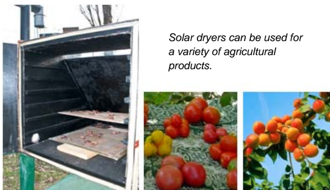
Solar dryers can be used for a variety of agricultural products.

A solar fruit dryer uses the warmth of the sun to dry fruits. It produces clean, dry fruits, and makes it possible to faster dry greater quantities. The solar fruit dryers are cheap and easy to construct with locally available materials.