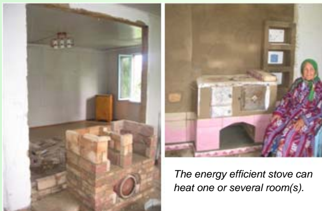
The energy efficient stove can heat one or several room(s).

An energy efficient stove burns fuel more efficiently and produces less smoke than conventional ovens. Through installing such a stove you will not only reduce your household fuel costs, but also improve your family's health. The energy efficient stove can heat your house with any kind of fuels such as coal, dry dung and wood.