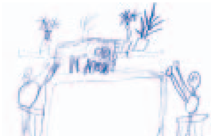
The Netherlands: you adults made this table too high for us

He and the trainer agreed that one of the preconditions for that is to put out of his head, not only the formal interview questionnaire, but also all the other implicit agendas he has when talking with children. These agendas range from a diagnosis of learning problems to advice about these.