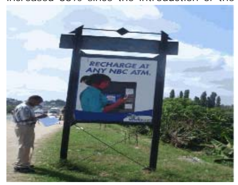
Figure 4: Billboard in Kinondoni. Before, random advertisements were being pasted on the municipal billboards. Now, the counsel can keep track of each billboard in the municipality, another example that has increased municipal revenue.

The ICT services have also resulted in higher revenues for the municipality: revenues increased 88% since the introduction of the