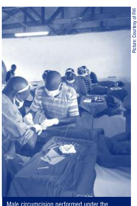
Male circumcision performed under the auspices of the Nyanza Reproductive Health Society in Kenya.

government's national VMMC initiative, working in collaboration with a local NGO, the Nyanza Reproductive Health Society, and Kenya's ministries of Public Health and Sanitation and of Medical Services. The MCC also conducts research and training in Nyanza Province in western Kenya.