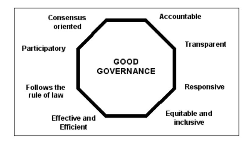
FIGURE 5: GOOD GOVERNMENT DIAGRAM

This will give us full assurance of minimized corruption, and people will be heard and justice taken for violation and responds constantly to present and future situations that can come up in our fight against sale of fake drugs in Nigeria. (UNESCAP, 2008)