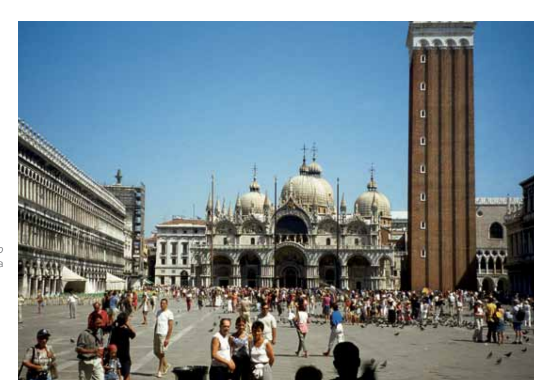
The Piazza San Marco

In the third volume, the writer highlights the historical importance of Istanbul, stating that under the Ottomans, who ruled the eastern Mediterranean for 500 years, cosmopolitan life in Istanbul—or Constantinople as it was then—took a particularly vigorous "It didn't take me long to find out that it is cosmopolitanism that makes these cities so similar. It is their ability to accept and integrate with other cultures, with the common aim of benefiting the world,"