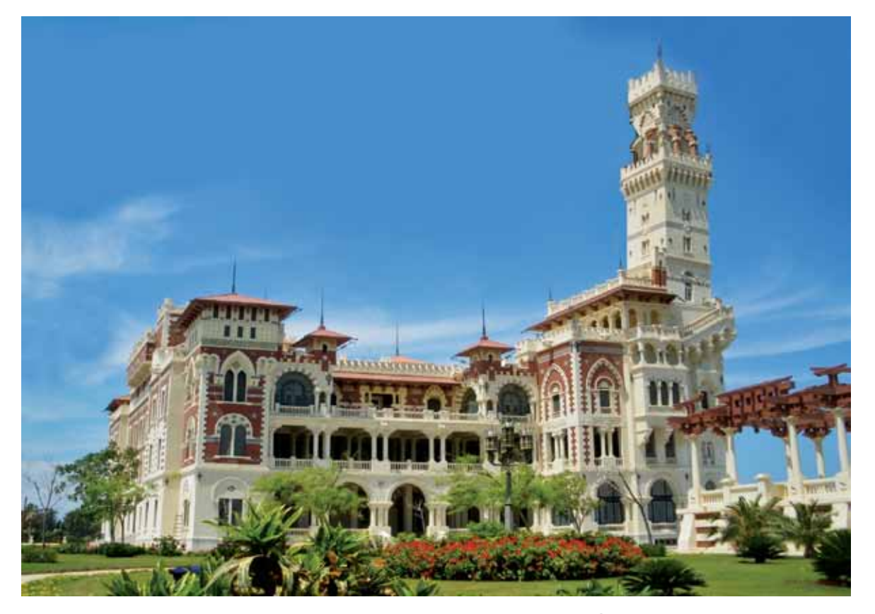
Montaza Palace in Alexandria, influenced by the European architecture

for water to run through and be served cool to passersby in sabils . In addition, the term Ablaq refers to the alternating courses of black and white masonry. This is in addition to terms related to and types of arches such as true arches, segmental arches, lancet arches, equilateral arches, flamboyant arches and depressed arches.