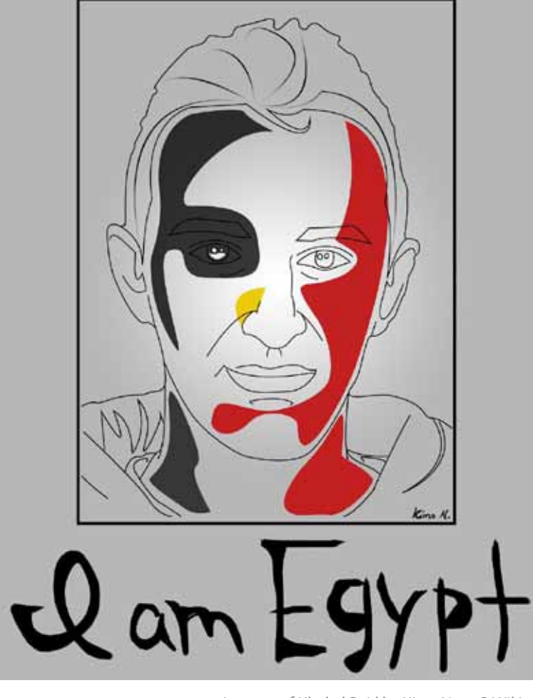
A poster of Khaled Said by Kimo Nour