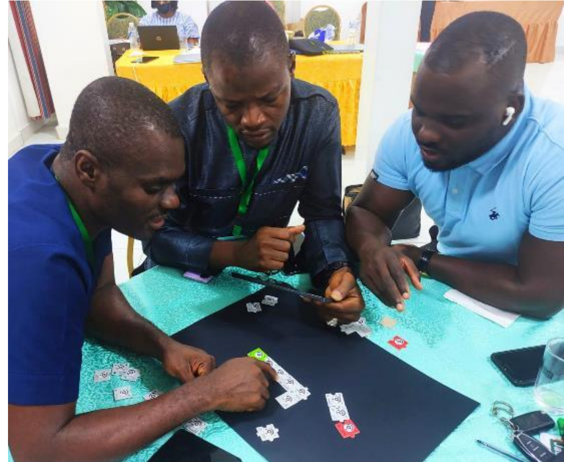
ICT coordinators are learning to use the coding game