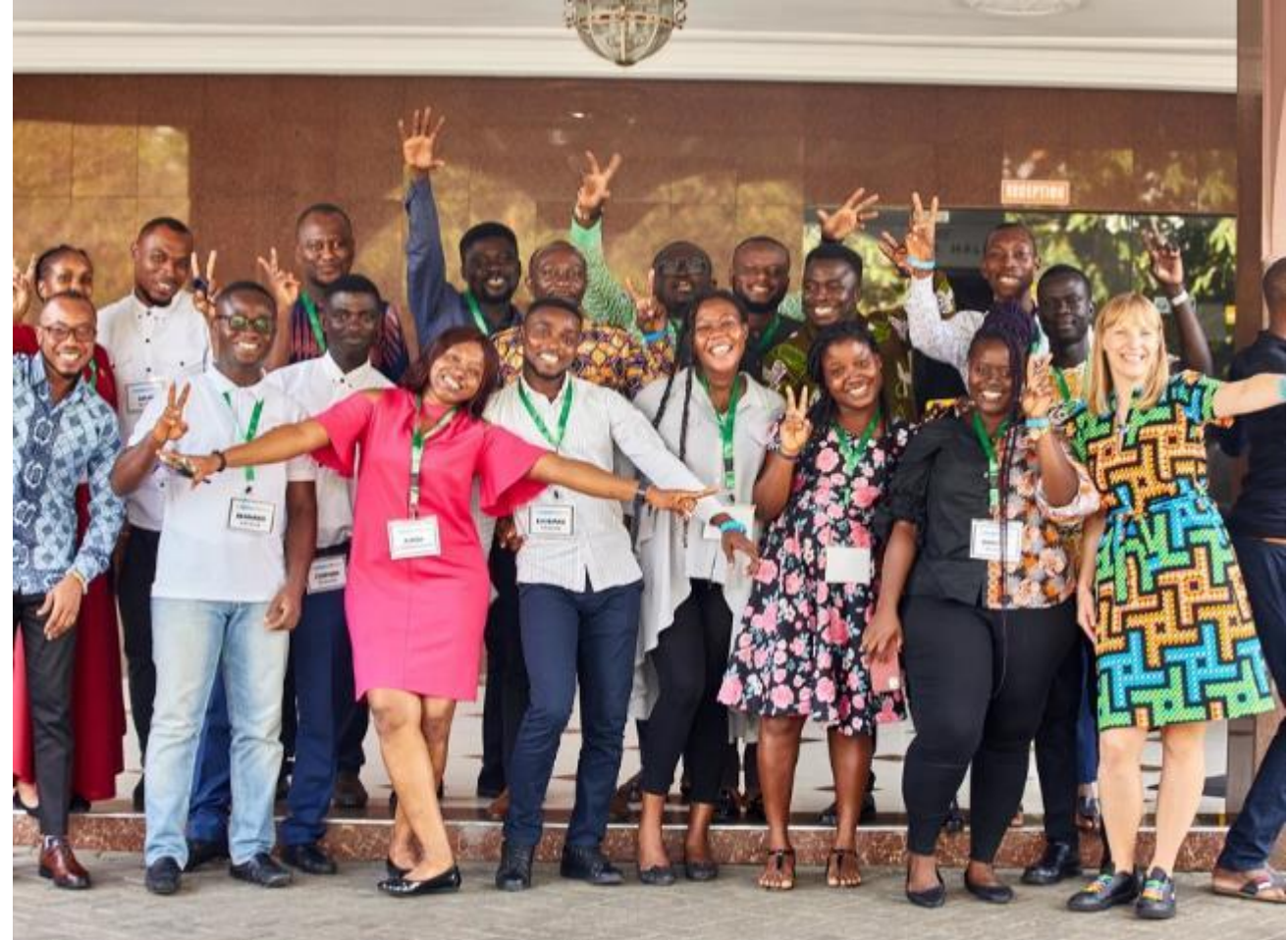
Participants of the Training of Trainers programme