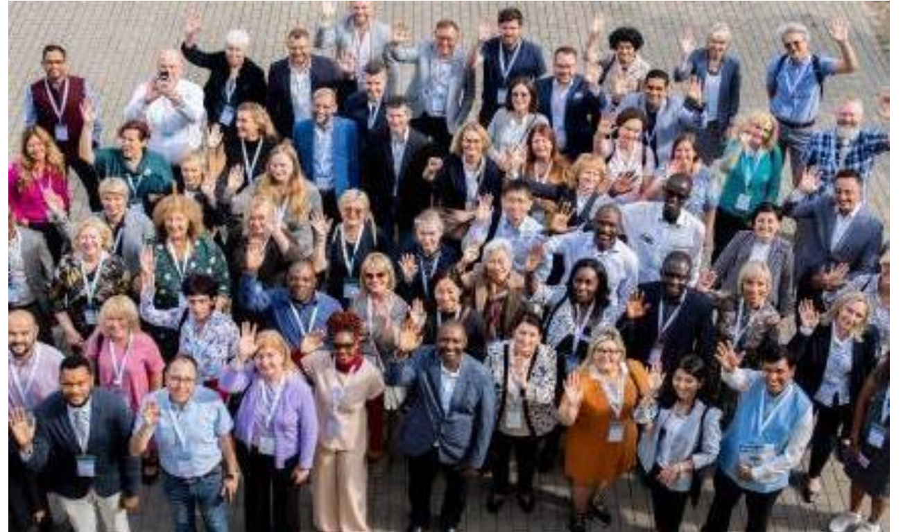
EIFL General Assembly 2023 in Vilnius, Lithuania