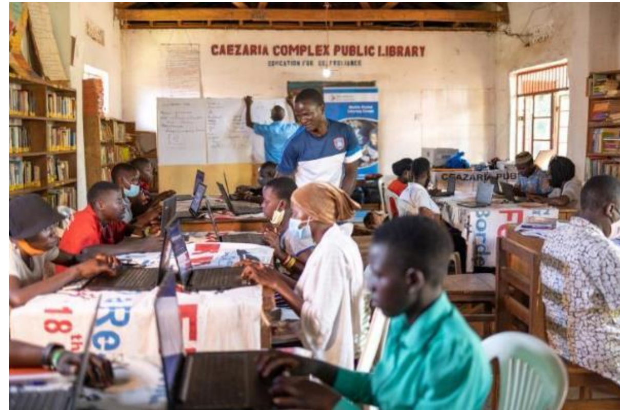
Digital skills training at Caezaria Complex Public Library