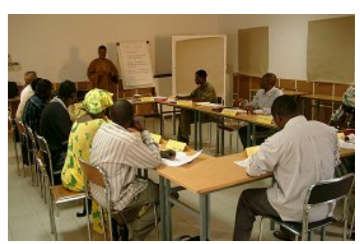
Lively discussion during the focus group

example leadership skills, might also motivate them to take an active role in the project.