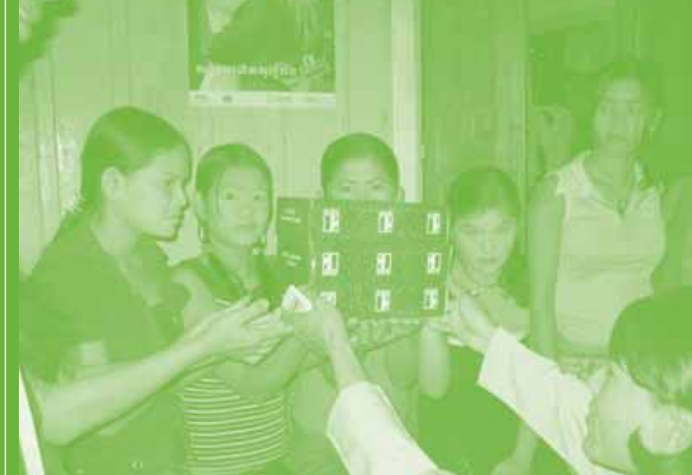
Condoms changing hands at a provincial monitoring and outreach meeting

Article produced as part of the KIC Project