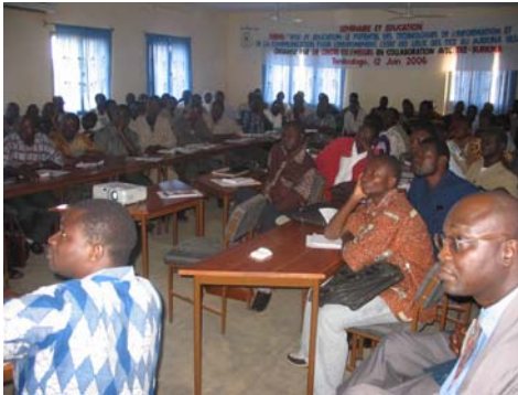
Awareness-raising seminar on the educational potential of ICT in the town of Tenkodogo (central-eastern region of Burkina Faso).

The consequences of participating in the project are not always seen in terms of pecuniary gain or increased recognition of the teacher for his/her newly acquired skills. Moreover, it is quite difficult to apply these newly acquired skills owing to constraints on resources, such as a well-equipped computer lab, a budget for photocopies or printing, etc. This may be due to the fact that schools do not always regard ICT as a high priority, or because the costs are not covered by the credits allocated to junior secondary schools.