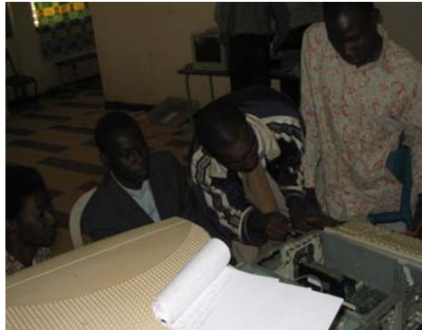
Teachers doing practical exercises during the training course in computer maintenance.

For one of these teachers, the training was an excellent opportunity to get involved with ICT, and this did not go unnoticed: after