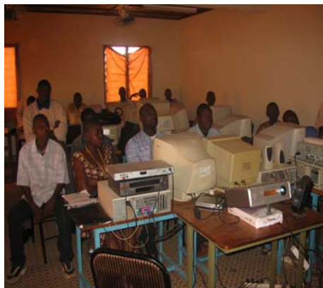
Group of teachers in multimedia training.

initiated by IICD, which promoted the use of ICT in the classroom in order to improve the quality of instruction. The project was implemented by the company Zongos Consulting & Productions. In 2004, based on the lessons and experience from the GTP project, Zongos launched the pilot project