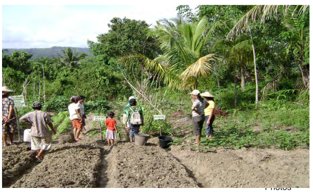
Demonstration plot for growing crops on Nias island

Preschool education was a next step. PESADA set up the first of many day care centres (DCC) in Tinada, the hometown of the Pakpak people. Very few fathers were involved in the care of their children; neither did they participate in parent meetings and discussion groups. Attendance of the children was also irregular, as many of the mothers who were dependent on their husbands' income did not receive money to pay for the children's education. Observing this, PESADA arrived at the understanding that women's access to and control over resources would make a huge difference, and responded by starting a savings and credit group for women.