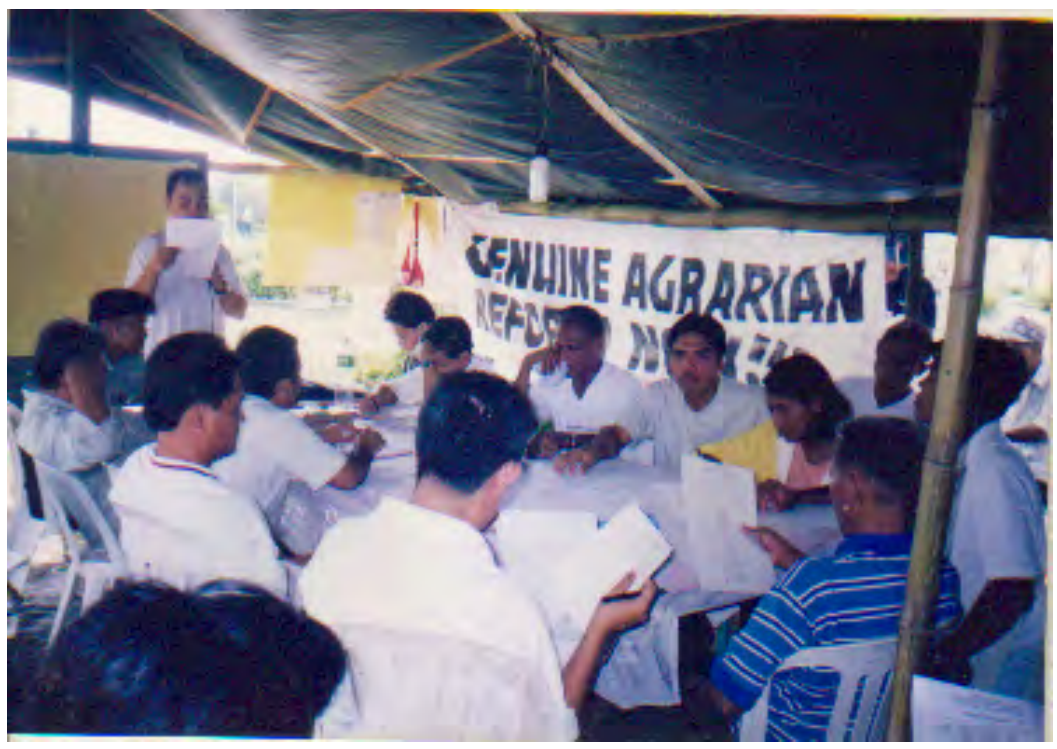
Strategy session on agrarian reform claim-making