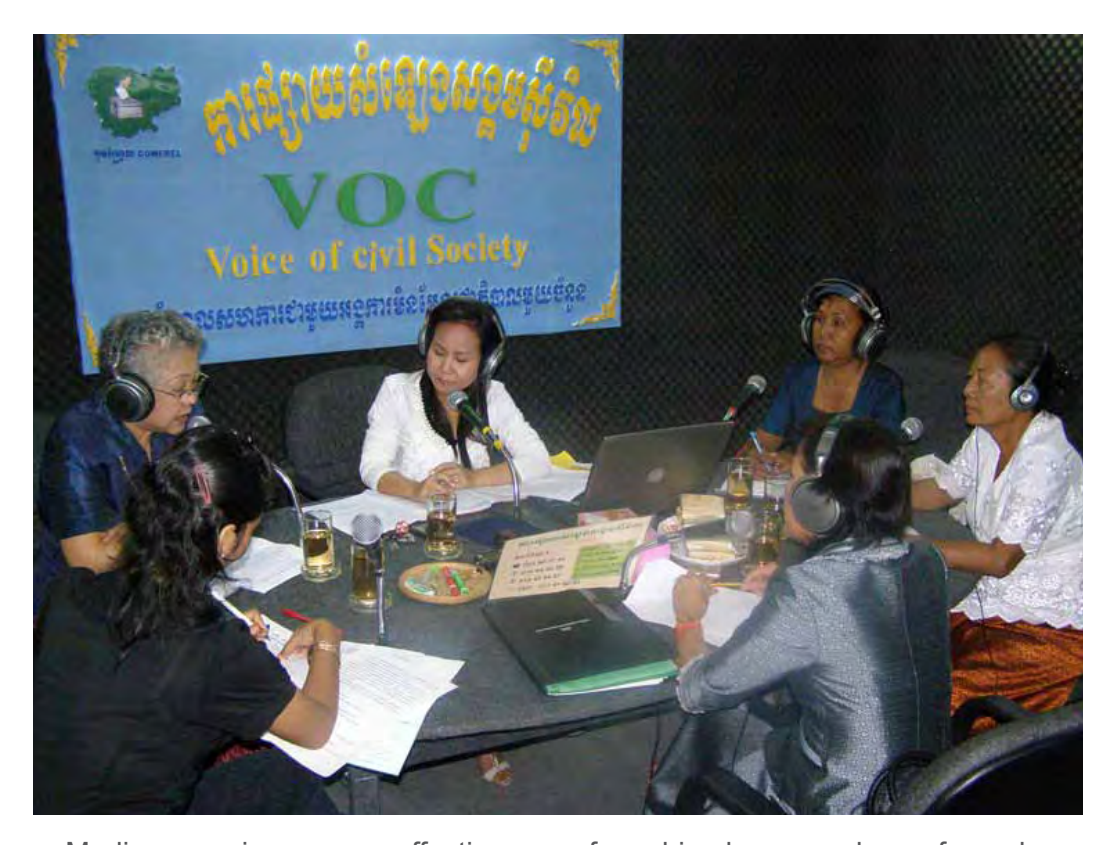
Media campaigns are an effective way of reaching large numbers of people.

Radio and TV spots, radio talk shows, TV round table discussions and press releases all help raise awareness, promote women in politics and attract the attention of political parties. Broadcasting is costly, but two of the organisations in the CPWP coalition, COMFREL and the Women Media Centre, are radio stations and donate air time to CPWP. Media campaigns are highly effective: the number of women candidates in the 2007 election doubled as a result of our media campaigns and the Ministry of Women's Affairs has expanded its programme by using our strategy.