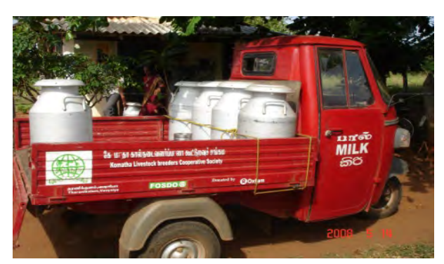
Milk hygiene, storage, collection and distribution were improved.

To further expand markets, the women's cooperatives started to develop value-added products like flavoured milk, curd, ghee, ice-cream and milk toffees. The success of these products improved the incomes of the cooperative members.