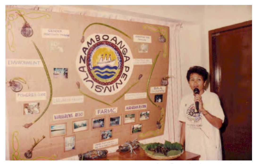
Area Reporting by women leaders

AADC is optimistic that gender equality will be achieved in our lifetime. The younger generation is changing, partly because of pressure from their peers, but also because of their parents' increasing awareness. For the first time, significantly, boys are learning to do household tasks. The younger generation is seeing more women in leadership roles in organisations, the political arena and in higher education; and they see women asserting their rights. Education is crucial in this, and AADC is working on having gender principles mainstreamed in the education system so that this will continue into the future.