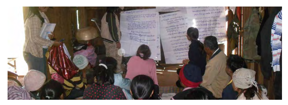
Coaching of sangkat women