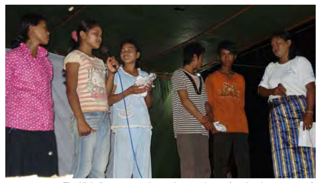
The Night forum: entertainment is a good way of getting the message of gender awareness across

The Night forum was for the general public, and everyone was welcome. The goal was to raise awareness on women's rights, women's leadership and gender. Local authorities, commune/sangkat leaders, activists and citizens gave presentations and took part in discussions with the public. Entertainment like films, songs, and role plays were used to convey gender equity messages to the audience.