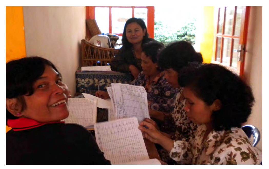
New skills are learned, such as basic bookkeeping

This points to another impact: the changing attitudes of many men. When PESADA first started its work, many men were resistant and even threatening – after all, they were used to having a dominant role as the income earners and decision makers. It took time for them to see the benefits that empowering women brings. They now play a greater role in family matters, and some men are proud that their wives are bringing in an income through the CU. Importantly too, PESADA has 11 male staff members who act as role models.