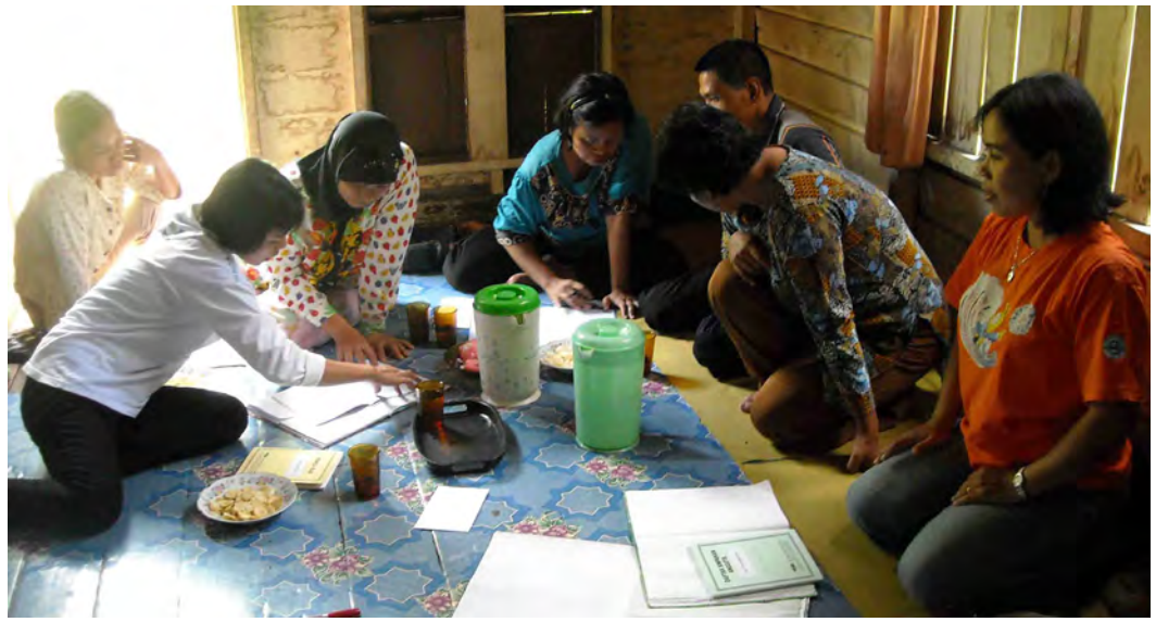
A KPUK meeting

business) on raising awareness of their situation and encouraging critical thinking and political awareness. Only when women see that they are being treated unfairly will they think about changing their situation, become politically active, and take on leadership roles. They will strive to find ways to access resources - not only financial resources, but also market and information - to invest in their businesses.