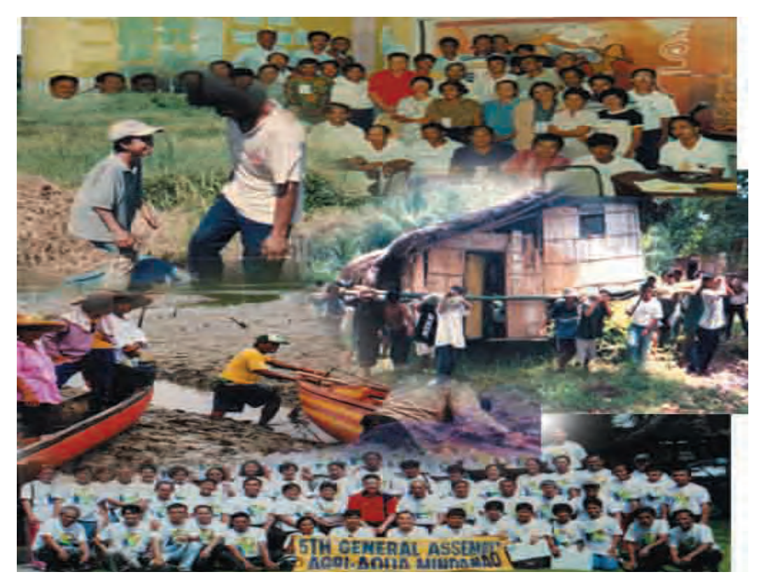
An impression of AADC's work1