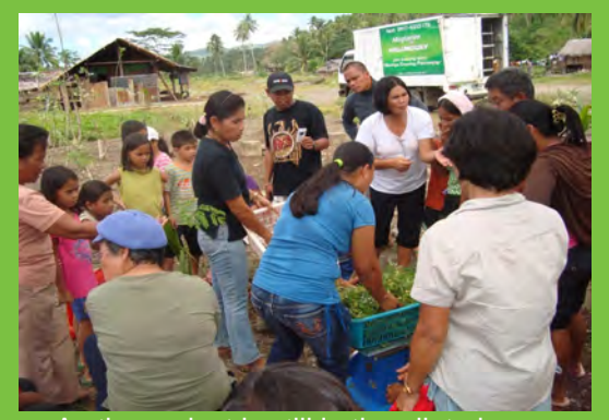
As the project is still in the pilot phase, sold directly to the purchaser, in this case Secura International, Inc.

Seeing the need for an alternative income generating crop, the moringa enterprise [was] started in 2009. The moringa is an indigenous tree with multiple uses and a wide range of product sub-sectors. Its leaves are highly nutritious, and the government already uses moringa products in it childhood feeding programmes. Almost every part of the tree can be used. The moringa can be used for food supplements, animal feed and pharmaceuticals. It even produces a special ion which can be used as a natural electrolyte to purify water for drinking. As it is a natural organic product, it may eventually replace the aluminium sulphate currently used.