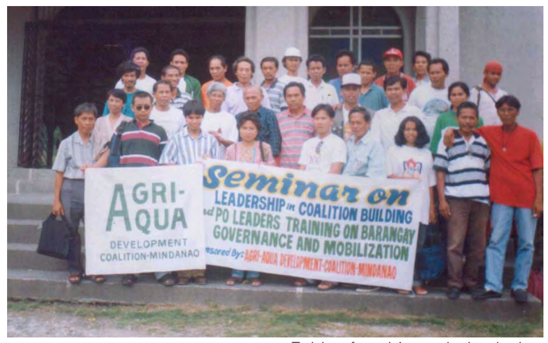
Training of people's organisations leaders

AADC is committed to creating sustainable rural communities which benefit from reforms in government, and ensuring that people's participation is genuine and meaningful. It is also committed to consolidating coalitions that work for change and for the development of the community. It strives to effect progress within the ranks of the rural poor through its flagship programme, Community Economic Development (CED). Using their common interests, the CED mobilises government, the private sector and civil society to make efficient use of resources (natural, financial and human) to achieve economic growth and equity. The foundation of the CED's work is gender equality, food sufficiency and environmental protection.