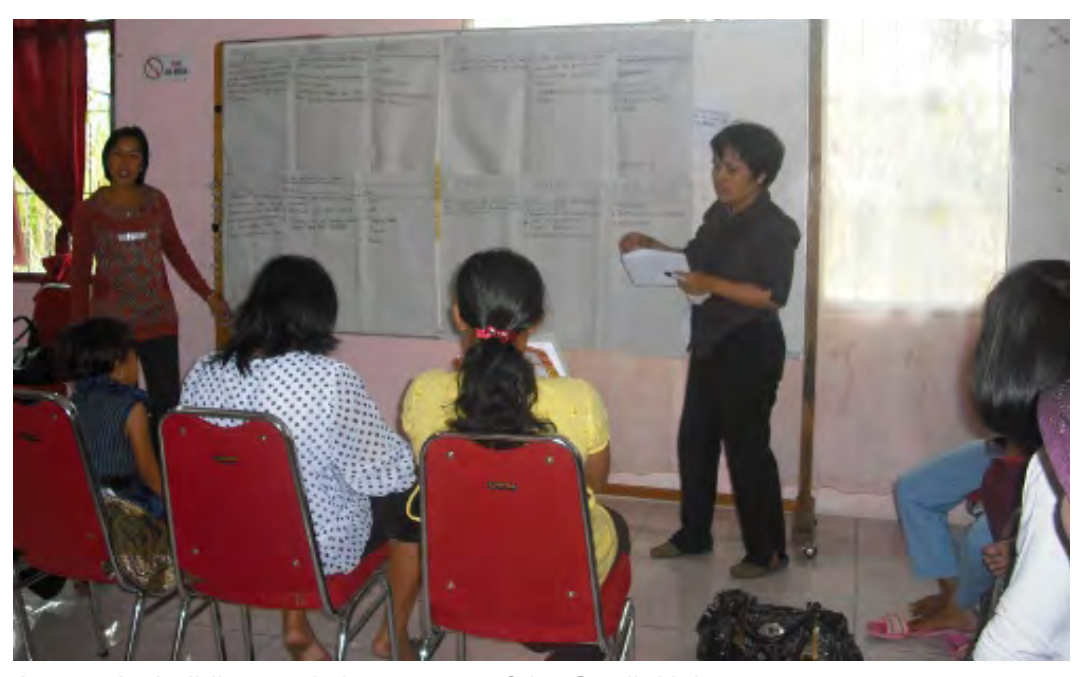
A capacity building workshop at one of the Credit Unions

manage their own business with their own capital. They also needed to be able to take control over the whole business process to reap the benefits themselves. The micro credit and loans were mostly used for agricultural activities to generate an income from which they would repay the loans and use the rest to pay the health and education expenses of their children.