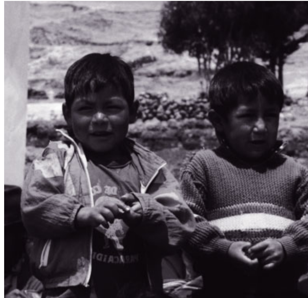
Peru: Ready for anything