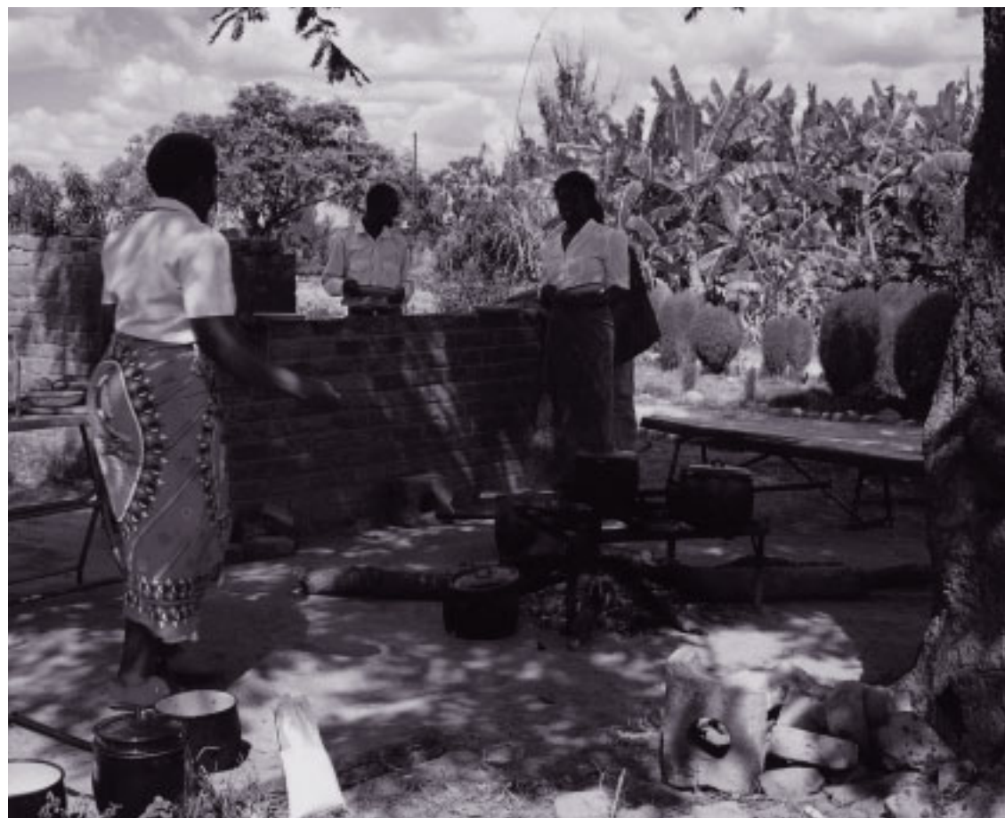
Zimbabwe: Community Kitchen Centre for Development Information & Education

The acronym 'ACT' helps to define what Zero to Three is trying to accomplish. 'A' refers to Advancing