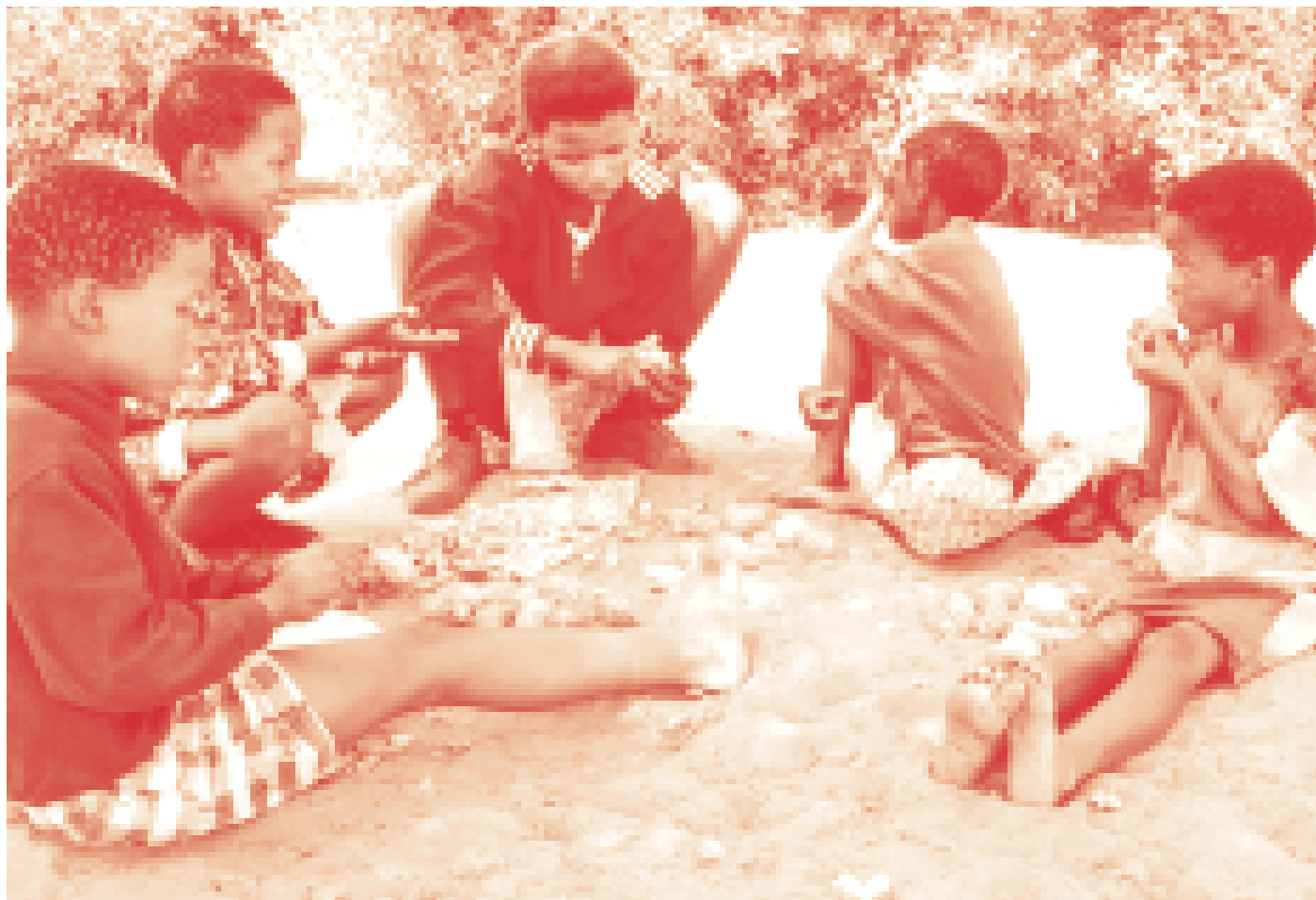
Children of the Earth project (Botswana) Children eating field food

laughing help children cope with experiences of violence and exile. The pre-school programme also encourages children to express feelings and experiences (including experiences about war and hunger) through games, story-telling, painting, drawing, theatre, making sculptures and masks, and so on. Beyond this, children are seen as messengers who contribute to the general dynamics of the community;