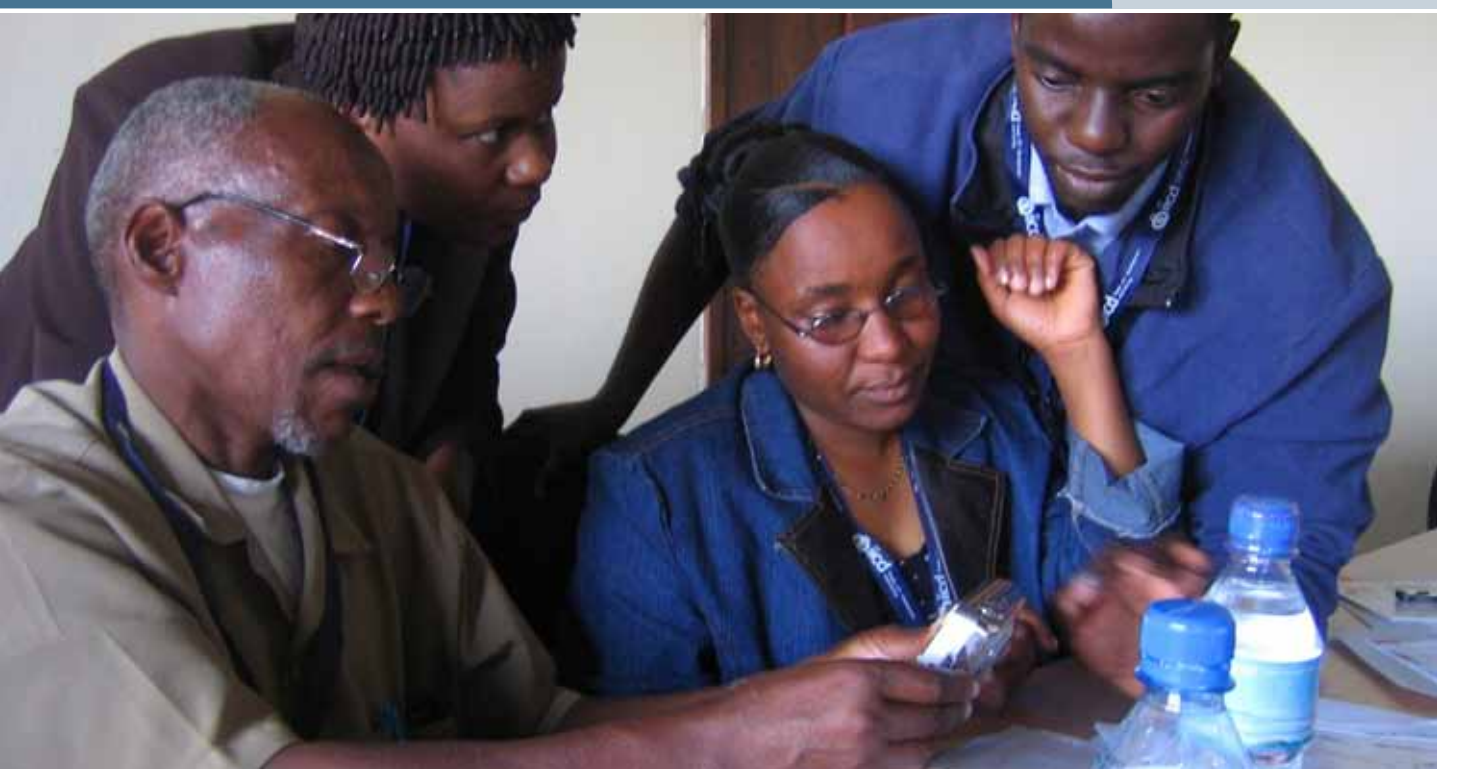
Telemedicine users getting familiar with a digital camera