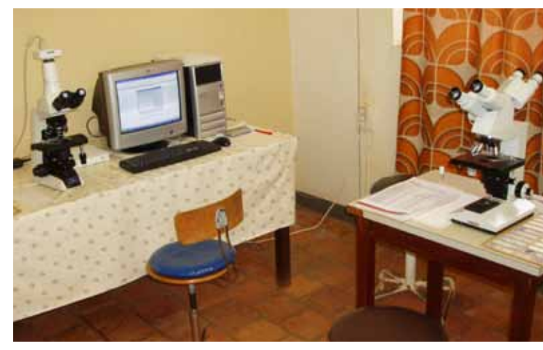
The camera connected to the left microscope is used to digitise tissue samples and send them to specialists.

Although a few sensitisation workshops for hospital management were done with the ICT4Health network AfyaMtandao, this was not an integral part of the original project concept. The project team mainly focused on the training of doctors. Hospital management was informed,