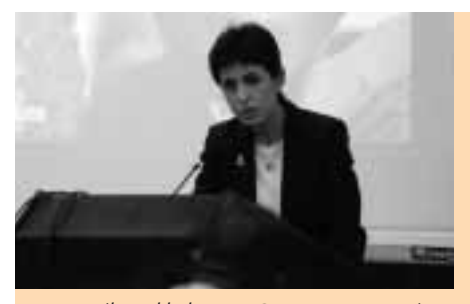
Hon. Leila Pakkala, UNICEF Representantive to Mozambique

In 1994 the Mozambican Government ratified the United Nation "Convention on the Rights of the Child", which emphasises the need for social and institutional transformation to attain the purpose of