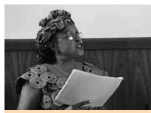
Hon. Virgília Matabele, Minister for Women and Welfare.