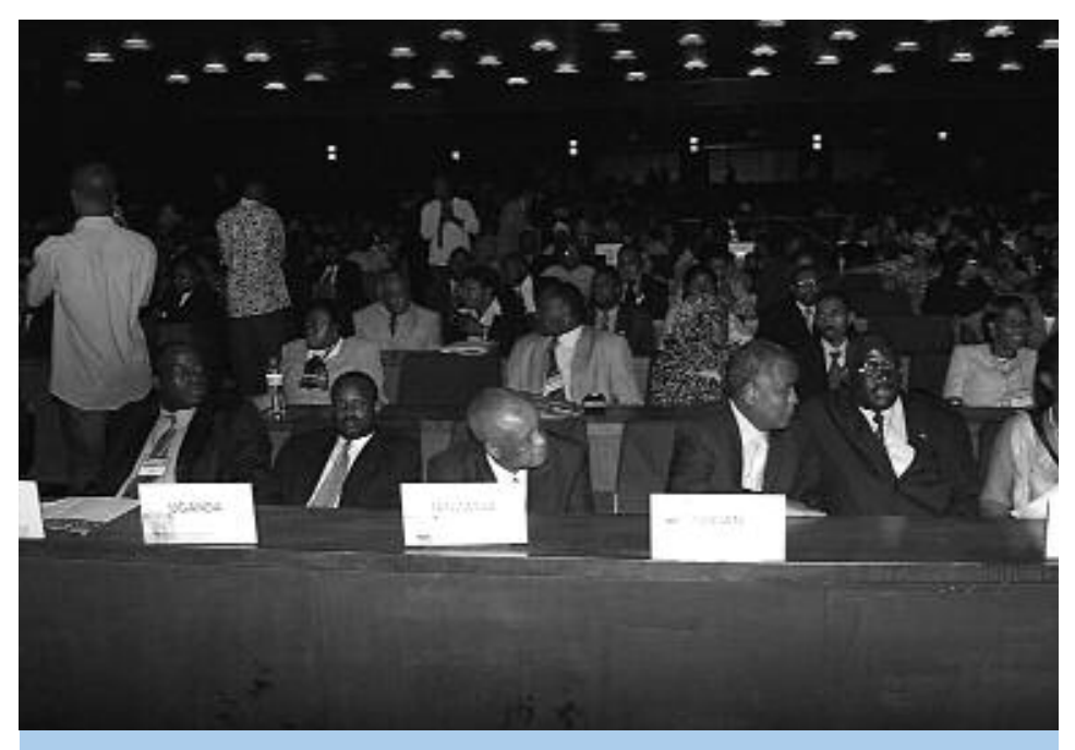
National delegates at the opening ceremony of the Kinshasa Conference.

<sup>2</sup> The recommendations and the Kinshasa Declaration can be perused in full on the AWEPA Internet site at :http://www.awepa.org.