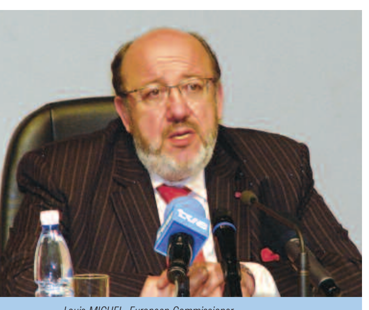
Louis MICHEL, European Commissioner