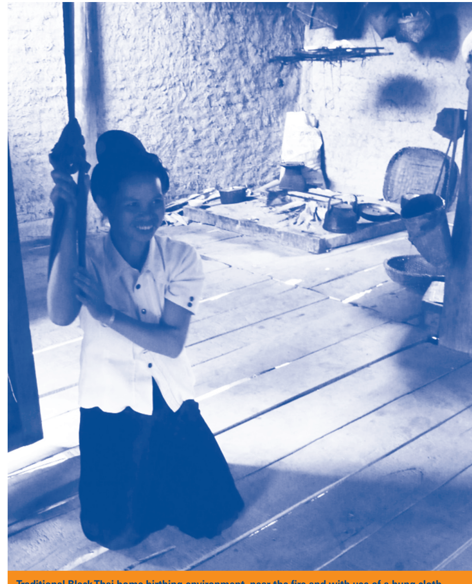
Traditional Black Thai home birthing environment, near the fire and with use of a hung cloth

In-depth one-on-one interviews were held with 92 women of reproductive age (15-49 years). Additional one-on-one interviews