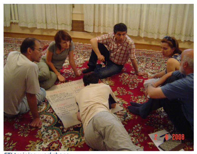
FTI training workshops

Timing, frequency and choice of content of capacity development are all equally important. The flow shown in Table 2 grew out of a process approach, in which the number of larger capacity-building events was according to the project plan, but content details for each developed as the process unfolded. Each subsequent workshop started with