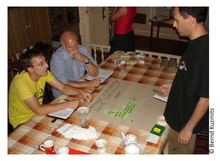
Brainstorming on the roadmap in the salinity assessment team