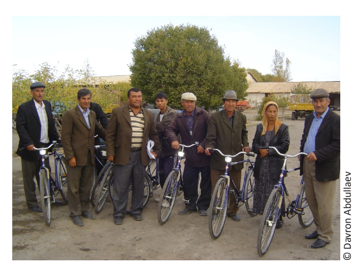
Bicycles improve the visibility and outreach of WUA staff

The WUA team proposed to improve farmers' ownership of the WUA through social mobilisation and training. However, WUA stakeholders perceived having an own office and means of transport as prerequisites for "having a face" and recognition by the community. The WUA team, after a series of discussions about the potential benefits and other modalities, agreed to contribute some funds for refurbishing the office of the WUA to increase its visibility within the community. The WUA requested materials from the project and decided to cover the labour costs itself.