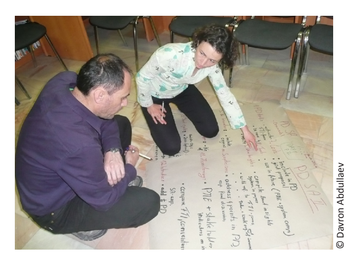
Visualising main issues raised

Livelihood and system benefits (long-term) Positive changes in regional landscape Appreciation and credit for project increased