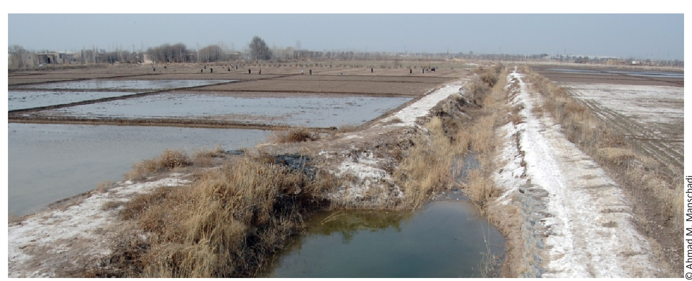
Large-scale irrigation in the Khorezm Region and associated salt accumulation

The target yields that a farmer must get from the assigned piece of land are also pre-determined, and it is the farmer's obligation to achieve or exceed that target. To help the farmers achieve the prescribed targets, the government provides a proportion of production costs in advance through the banking system. The farmers can use this advance to