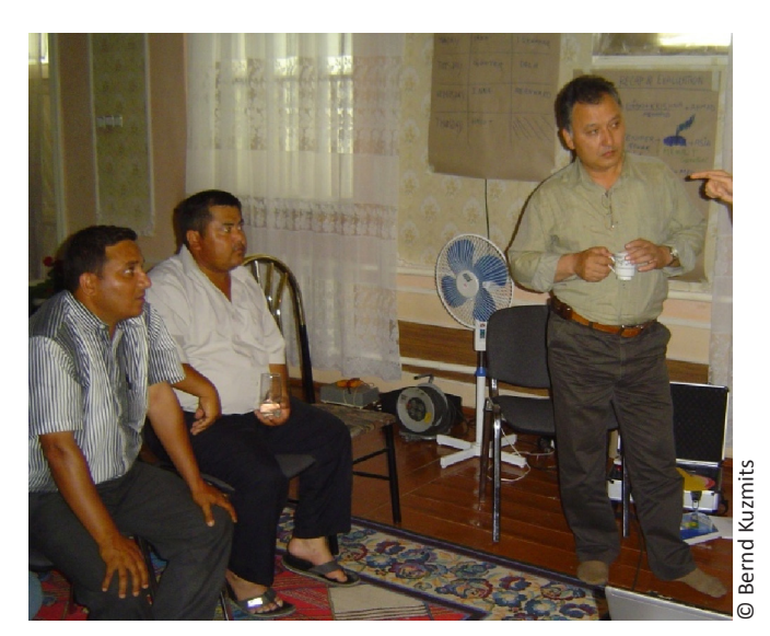
Building the conservation agriculture team

A critical point is the creation of enough time for the lead staff members to spend on FTI. If not, scientists might see FTI as an additional task to their regular research and capacity-development tasks. If possible, the FTI work should be declared the main responsibility for scientists whose innovations are considered for testing under this process.