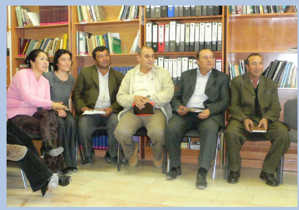
Members of the WUA core group joined all FTI training events