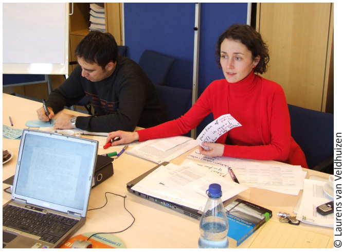
FTI writeshop in January 2011