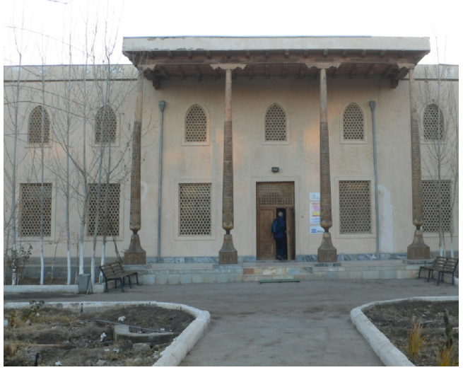
Project office at the compound of Urgench State University, Uzbekistan