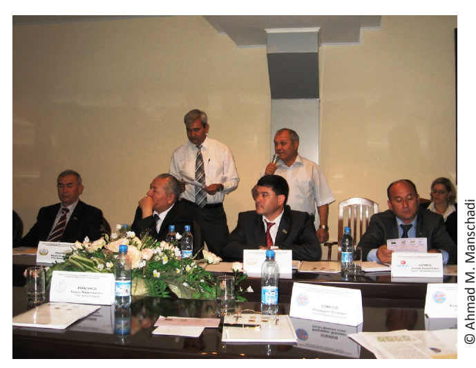
Symposium for the Uzbek Parliamentary Committee on Agriculture

were submitted to the Ministry of Agriculture and Water Resources for further checking;