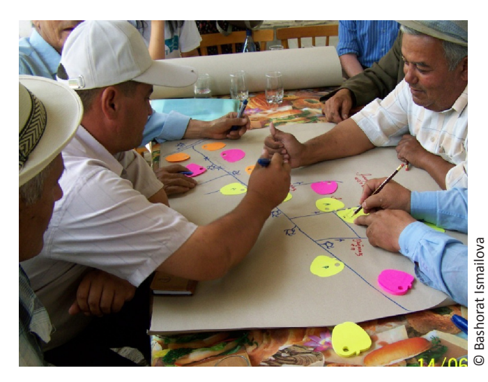
Canal mapping by WUA members

Having prepared itself for the main design steps and possible M&E components, the FTI team plays a double role in: i) helping stakeholders define their M&E needs and related activities by asking systematic questions step by step; and ii) defining, if needed, its own (further) learning needs and related M&E activities complementary to those of the stakeholders.