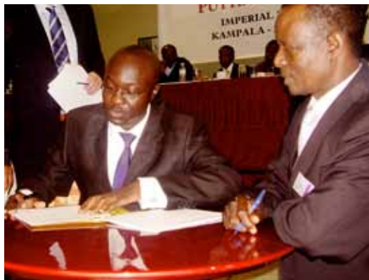
Acting Secretary General Conservative Party and Chairman signing MoU