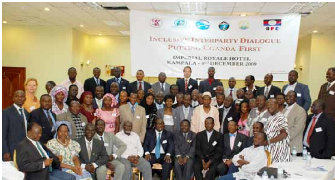
Ugandan and Ghanaian politicians