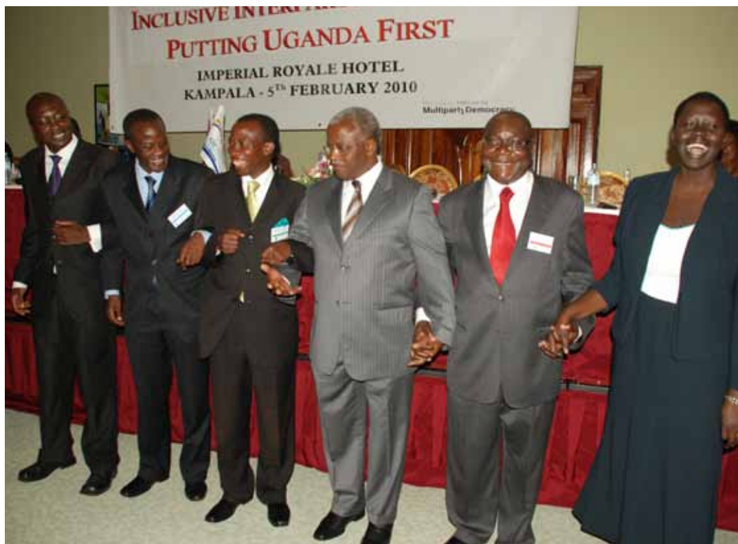
All signatories after the signing of the Memorandum of Understanding

Since Uganda's independence in 1962, ruling and opposition political parties have engaged in political battles using missiles of abusive words against one another, sowing seeds of hatred. But with the help, sponsorship and facilitation of the Netherlands Institute for Multiparty Democracy (NIMD), all six parliamentary political parties have signed a Memorandum of Understanding (MoU) under which they will work together, through dialogue, towards sustainable multiparty democracy and development of Uganda.